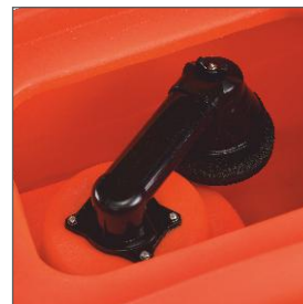
Easy tank cleaning, thanks to the large tank opening. Tank can be emptied quickly and easily via the large outlet hose. Overflow protection for the dirty water tank.