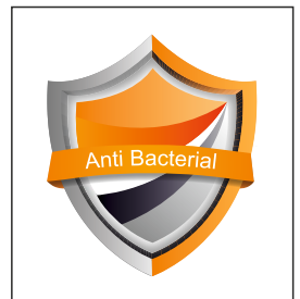
Anti bacterial tank has special coating that prevents the build-up / growth of bacteria.