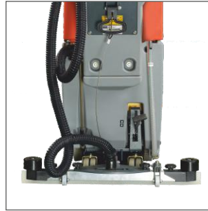
Professional self levelling Squeegee Ensuring Excellent performance