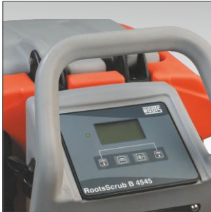
Ergonomic handle for operators of any height. Excellent view of the area to be cleaned. Soft touch buttons for selection of operation. LCD panel with display of hour meter, battery level.