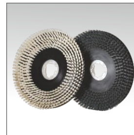
Variety of brushes to suit different applications.