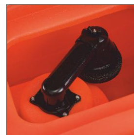
Easy tank cleaning, thanks to the large tank opening. Tank can be emptied quickly and easily via the large outlet hose. Overflow protection for the dirty water tank.