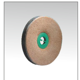
Pad holder available as option