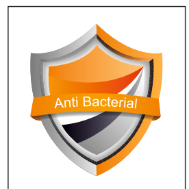
Anti bacterial tank has special coating that prevents the build-up / growth of bacteria.