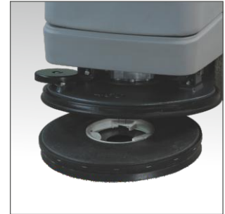
Brushes can be changed quickly without the need for any tools at the push of a button.