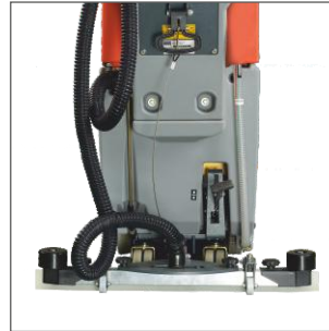
Professional self levelling Squeegee Ensuring Excellent performance