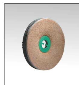
Pad holder available as option