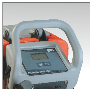
Ergonomic handle for operators of any height. Excellent view of the area to be cleaned. Soft touch buttons for selection of operation. LCD panel with display of hour meter, battery level.