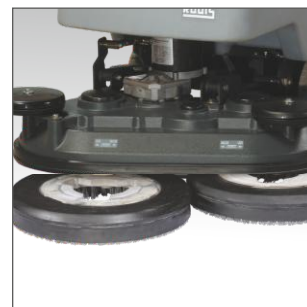
Brushes can be changed quickly without the need for any tools.