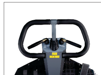
To facilitate effective and efficient cleaning operations, Brush controls are mounted on the steering column.