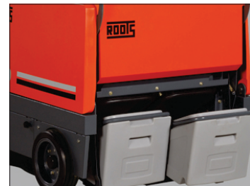
Easy to remove and dispose dual hoppers.