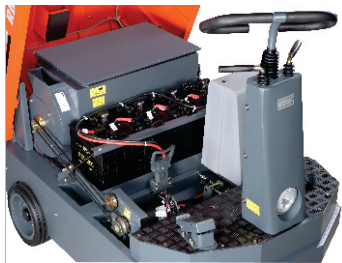
Four heavy duty deep cycle batteries provide extended run time and increased productivity.

RELIABILITY: Rugged, High quality build, robust construction and essential mechanics ensure reliability.