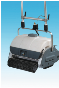
Brush exchange simple and easy without tools.

SMART CARE - A simple and easy to use carpet cleaning equipment • Three cylindrical brushes to agitate the Crystal chemistry and lift pile, all in one pass • Variety of brushes to suit different carpets • Exchange of brush without any tools • Handle can be easily and quickly removed (without any tools) for transport or storage • Large fresh water tank for long hours of cleaning • Removal of tank needs no tools • Electrical pump for uniform chemical spray