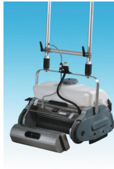
In-built collection tank 1.7 litres. Removal without tools.