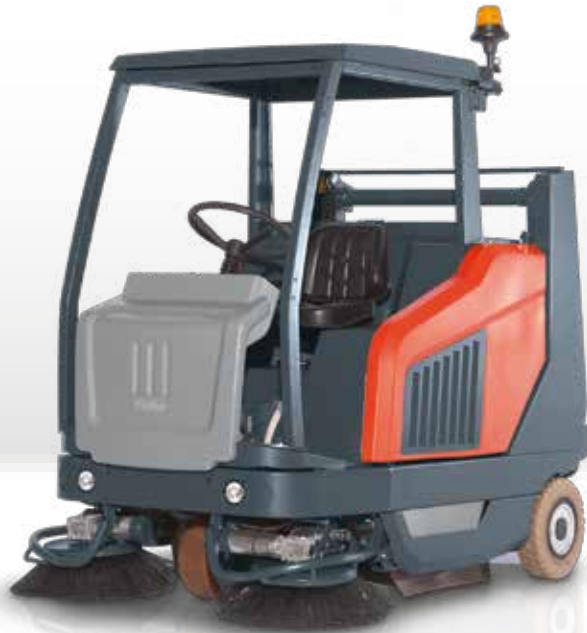
Sweepmaster P1500 RH with optional cab safety roof