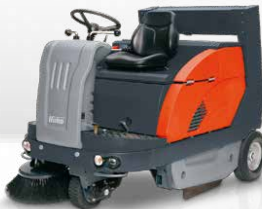
Sweepmaster P1200 RH