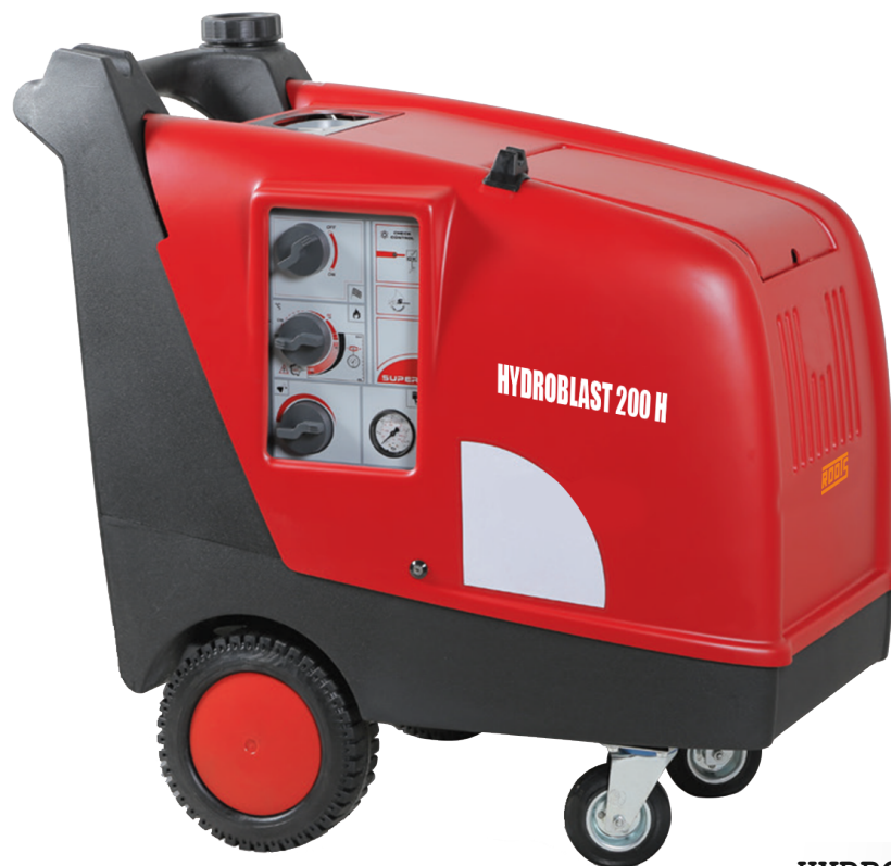
HYDROBLAST 200 H