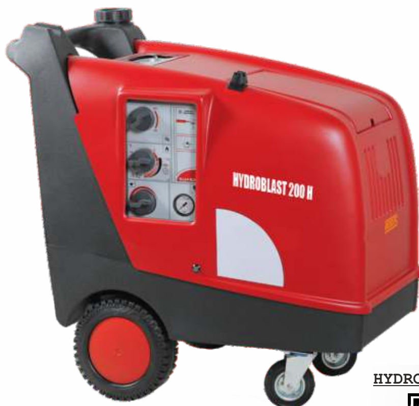
HYDROBLAST 200 H