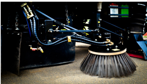
Large side broom with flexible head