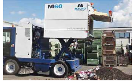
Very large volumes of dry collected waste. 6 m3 Sweeping and climbing over 20% full-load. The Exclusive capability to sweep in unbalanced conditions hopper and 6000 kg payload is the highest capacity on the market, allowing long working shifts.

The M60 is the most advanced and performing mechanical-suction sweeper in the market today thanks to years of continuous development. Its 6 cubic metre hopper volume and 6000 Kg net payload are unmatched parameters that allow this superb sweeper to work in the heaviest-dust conditions, both urban and industrial. The very Large Filter Surface area of 20m<sup>2</sup> make the machine work dust-free even in the dustiest situations. To the well-known and appreciated characteristics and reliability of the Standard version, the CanBus (CB) version adds further unparalleled and innovative performances.