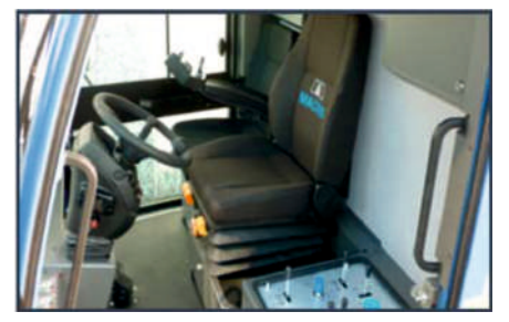
Spacious and comfortable cabin with 2 homologated Easy-to-use keypads to operate the machine. seats and user-friendly controls.