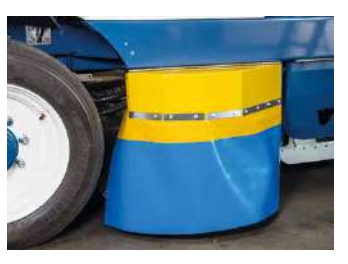
Fully adjustable third front brush that allows to sweep 180° left and right side.

Dumping at any height between 1,1 and 2,3 m.