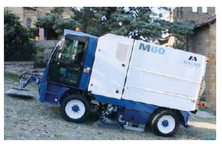
4-wheel steering gives the M60 excellent manoeuverability in all working conditions.