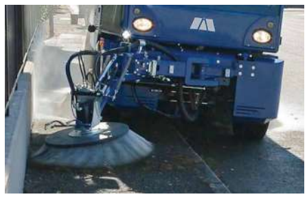
(ex. sidewalks). The system allows to sweep on bumps with no operator's action required.