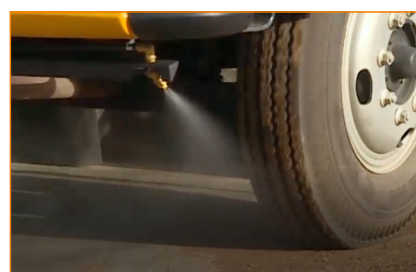
Front Spray Bar

Roots reserves the right to make any changes considered necessary for the purposes of improvement at any time or for any reason without prior notice, in line with its policy of continuous product development and progress.