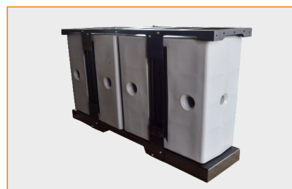
Additional Water Tank