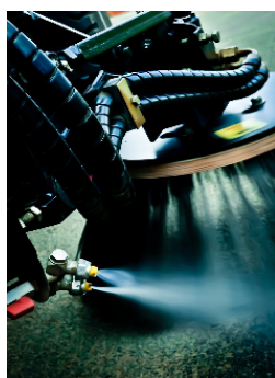
Water Jet for Dust Suppression