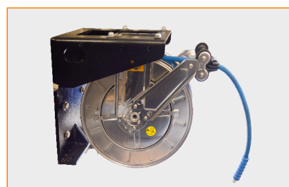
Additional High Pressure Jet Cleaner