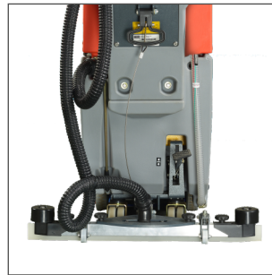
Professional self levelling Squeegee Ensuring Excellent performance