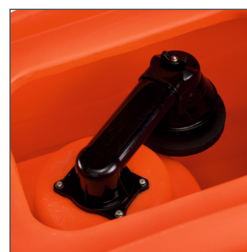
Easy tank cleaning, thanks to the large tank opening. Tank can be emptied quickly and easily via the large outlet hose. Overflow protection for the dirty water tank.