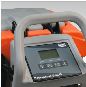
Ergonomic handle for operators of any height. Excellent view of the area to be cleaned. Soft touch buttons for selection of operation. LCD panel with display of hour meter, battery level.