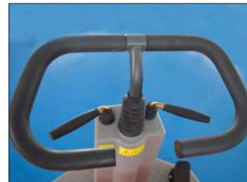
To facilitate effective and efficient cleaning operations, Brush controls are mounted on the steering column.