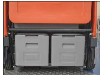
Easy to remove and dispose dual debris hoppers.